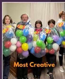
Keystone Finance Team