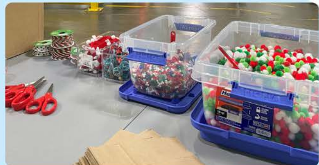
We had over 50 raffle prizes to give to lucky attendees, and the kids had a fun time making ornaments at the arts and crafts table.

We'd like to thank everyone who helped set up the event and made it a success. We couldn't have done it without you!