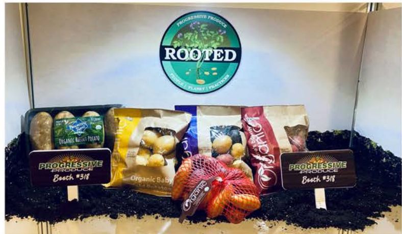
Sustainable packaging on display at OPS.

To accompany the social responsibility aspect of Rooted comes our sustainability program. We have worked tirelessly to come up with packaging options that are friendlier to our planet. We have developed paper bags that are eliminating the harmful plastics that have been used time and time again in the past. We have adopted recyclable meshes, bags and tags for our products that are purposed for reuse and not just meant to spend eternity in a landfill. This has been an industry wide effort and we are starting to see it pay dividends.