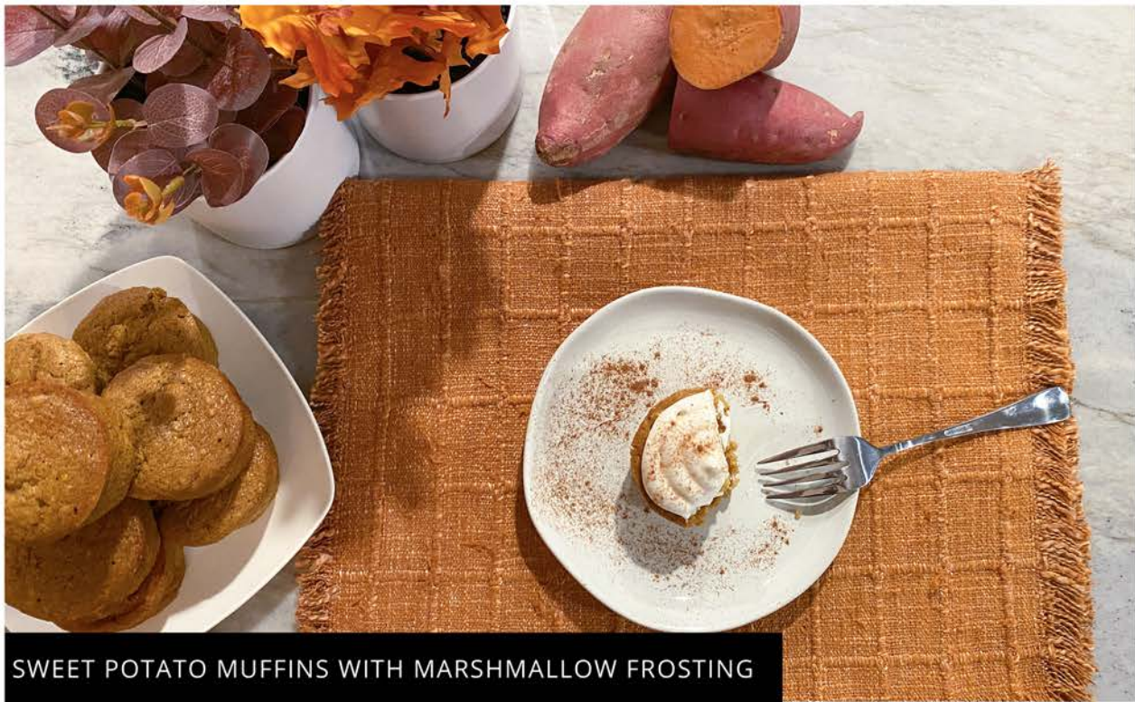
SWEET POTATO MUFFINS WITH MARSHMALLOW FROSTING