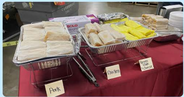
A mariachi band provided festive music while everyone enjoyed delicious tamales, tacos, and churros.