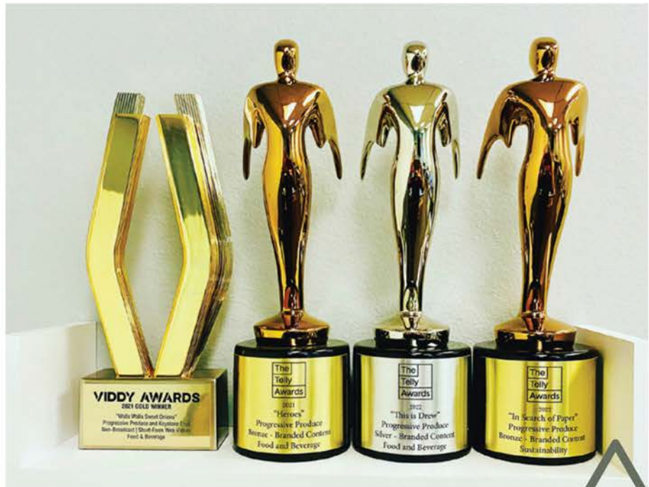
Progressive Produce's "In Search of Paper" video has received three different awards while its "Heroes" video received two on top of multiple packaging and design awards